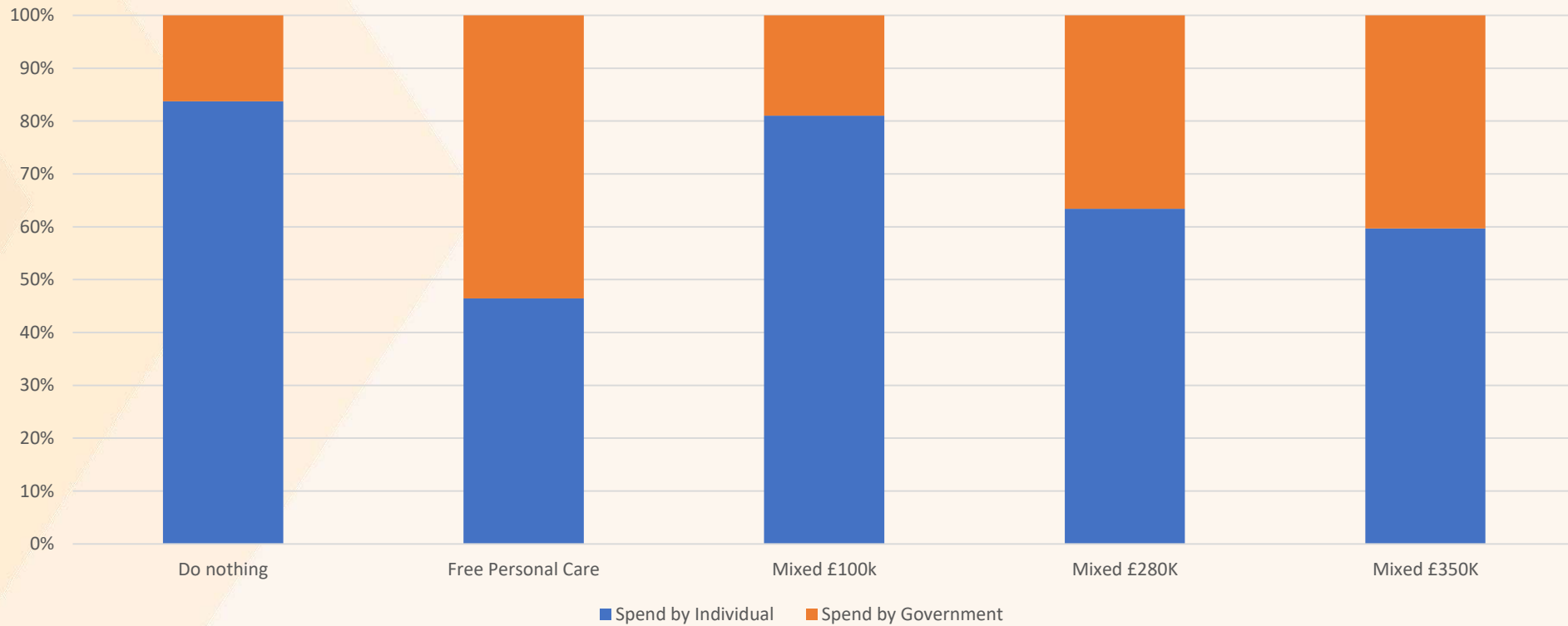
Spend on Fees - Government vs Individuals