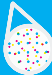
Plastic fragments and polystyrene