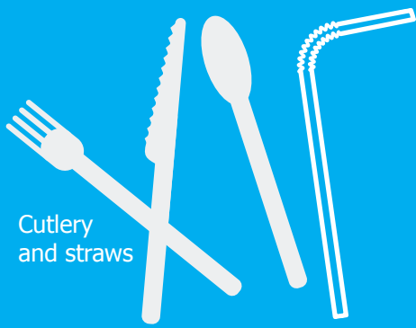
Cutlery and straws

Plastic on our beaches Single use plastic items represent approximately 50% of marine litter on Manx beaches Commonly found items*