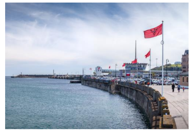
Page 18 of 33

consumes their own alcohol while paying for the service." This respondent also suggested that, "the risk to public health and safety from these style of business are far greater than that of premises offering supervised, licensed sales of alcohol. There is nobody in many of these business supervising consumption, maintaining age related drinking laws