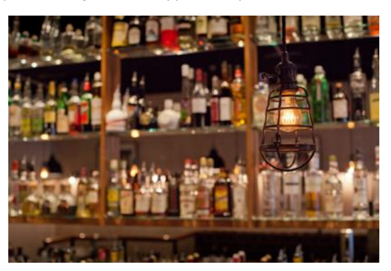
Page 6 of 33

drinks producer sector which is now a fast growing sector and generating substantial returns for the Treasury and IOM Customs and Excise." With regard to occasional licences it was felt that "there needs to be a recognition that the licensed selling of locally produced drink products in sealed bottles or containers for consumption off premises or outside an event, is very different from the proposed sale of drinks over a bar on a